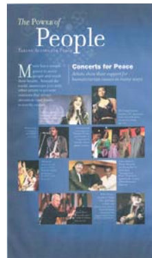
Exhibit Opening Program

“Music can change the world because it can change people.” Bono